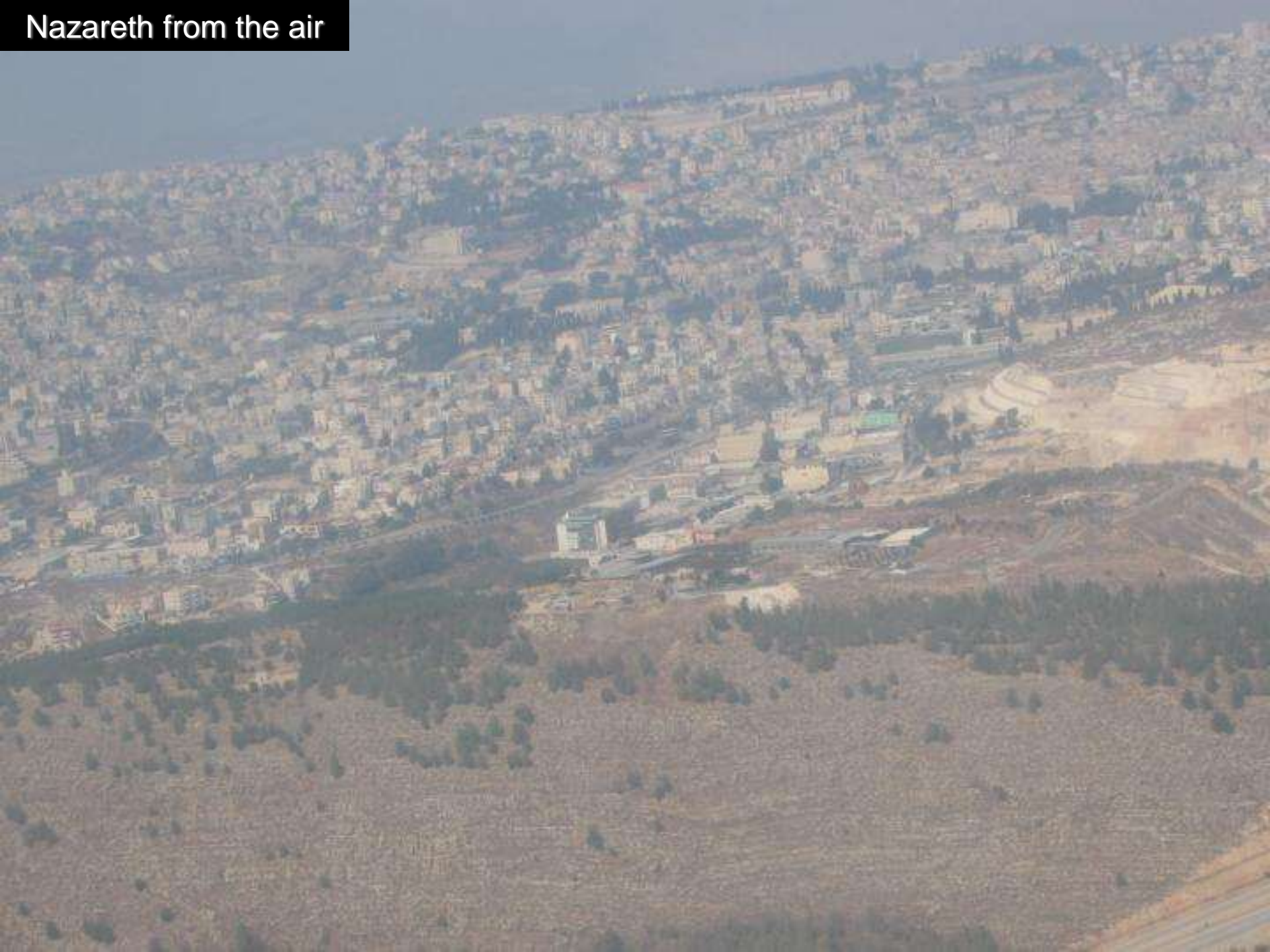
Nazareth from the air