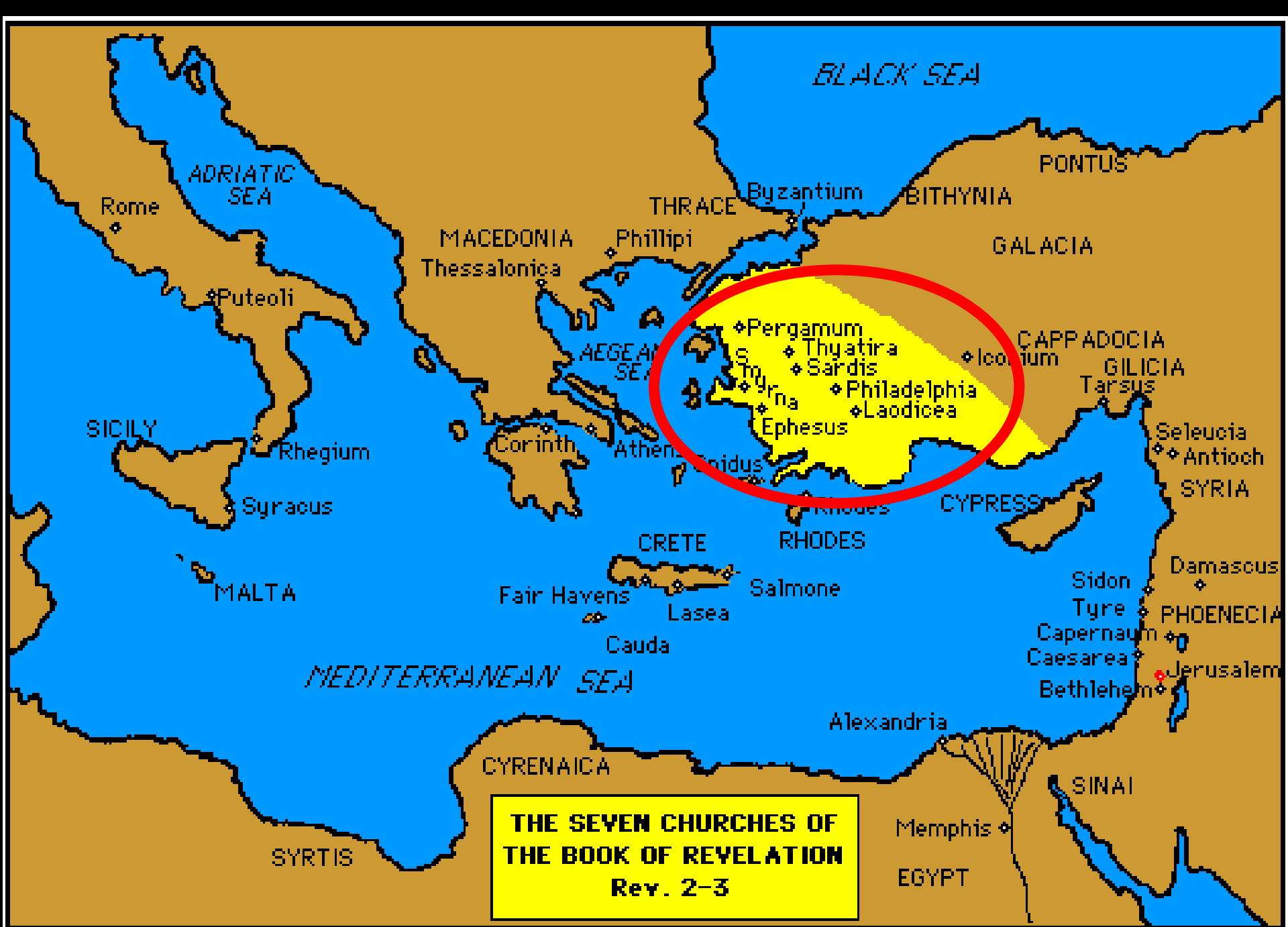
THE SEVEN CHURCHES OF THE BOOK OF REVELATION Rev. 2-3