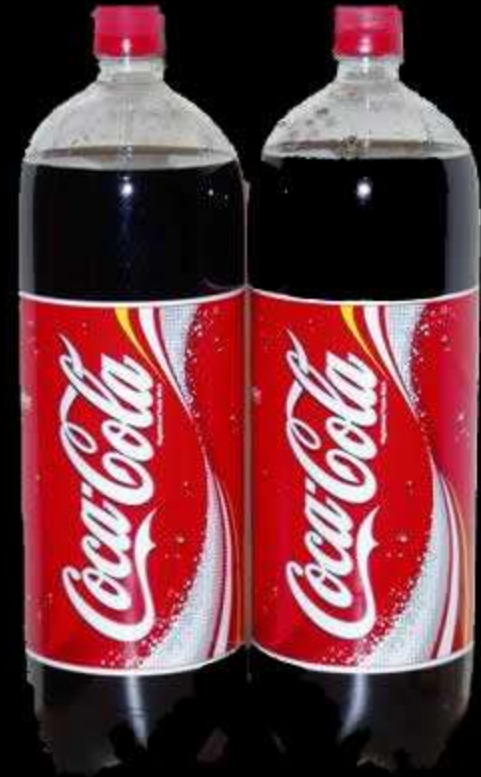
2 Litre Bottles